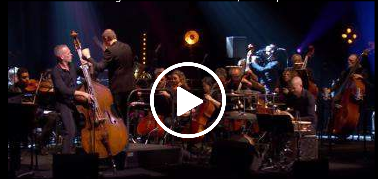
An Evening with Avishai Cohen -Paris Philharmonie