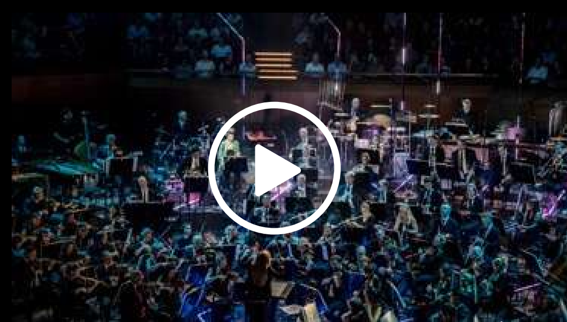
World of Warcraft, Warlords of Draenor/The Danish National Symphony Orchestra (LIVE)