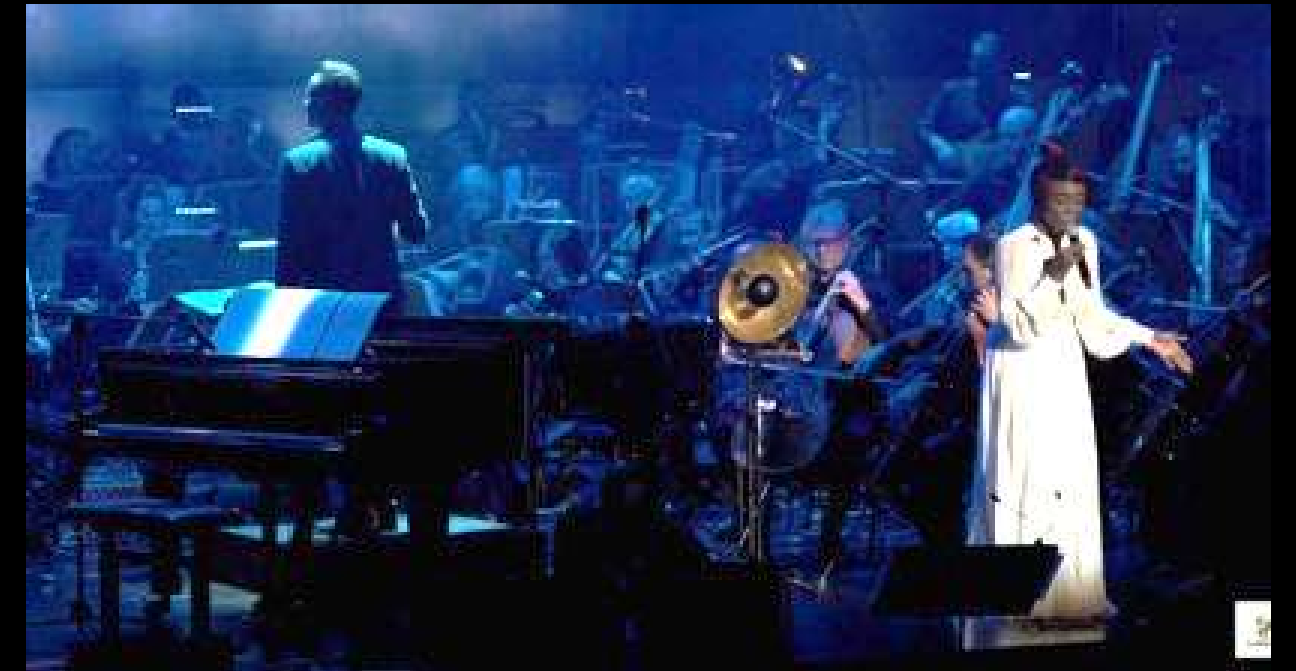
Laura Mvula Orchestral Evening, Szczecin Philharmonic 2019