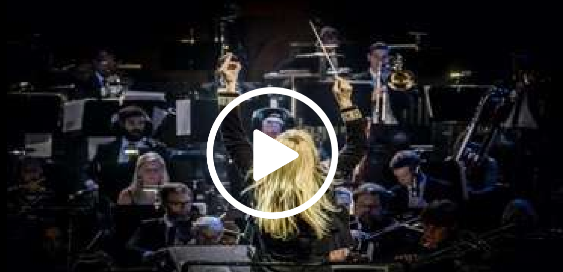
2018 | Video Games Music Gala | Lifeline from Runes of Aran