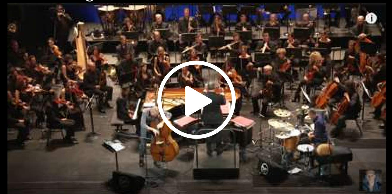
Gothenburg Symphony Orchestra Trailer