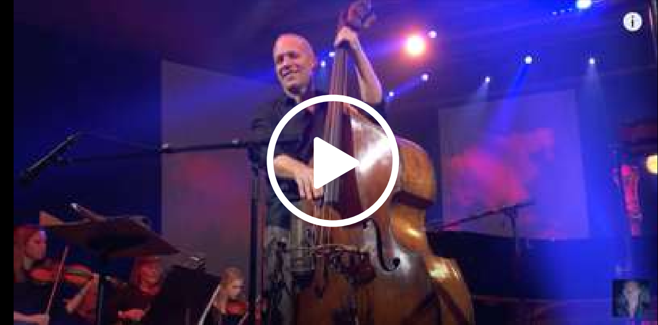
Live from Nancy Jazz Pulsations, 2018)