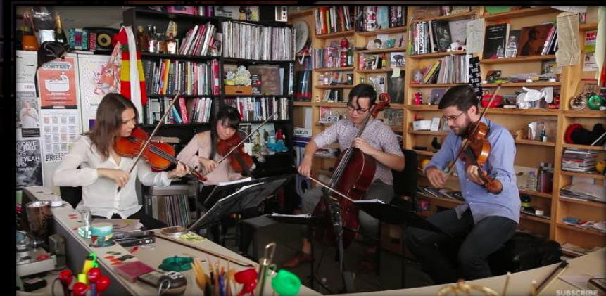
NPR Music Tiny Desk Concert: Attacca Quartet