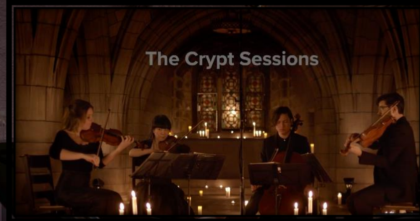
Beethoven, String Quartet in A minor Op. 132 III. Heiliger Dankgesang © Attacca Quartet