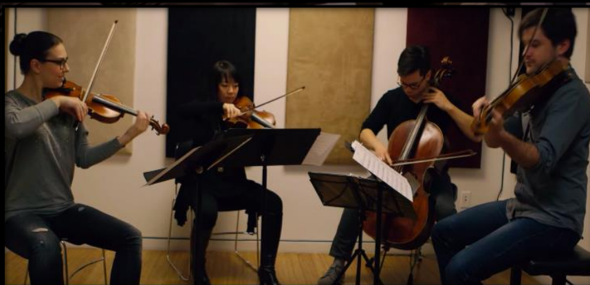
Star Wars - May the Force Be with You © Attacca Quartet