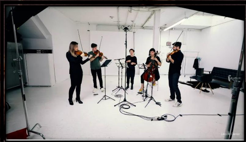
Attacca Quartet with Caroline Shaw at the Lincoln Center, Offstage